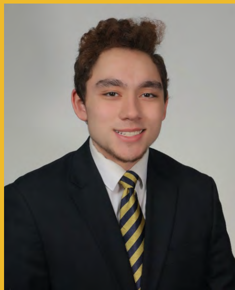
Political Science/Policy Studies Sturbridge, MA