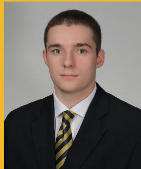
Policy Studies Silver Spring, MD