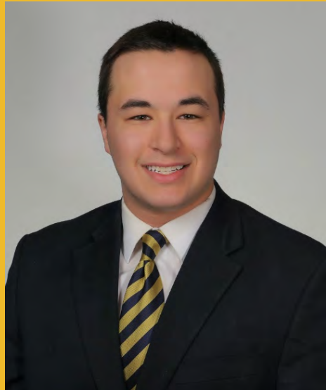
Sport Management Weston, CT