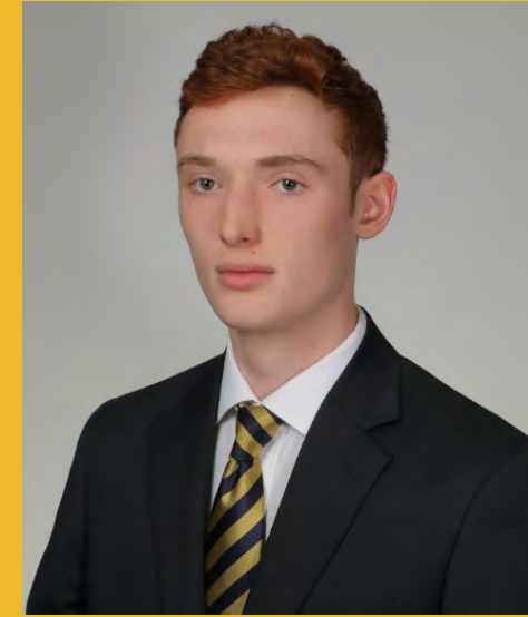
Advertising North Andover, MA