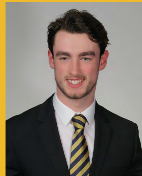
Finance Glen Ellyn, IL