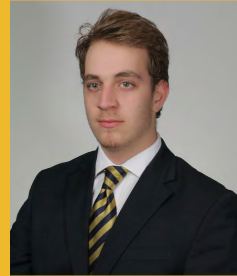
Public Health Longmeadow, MA