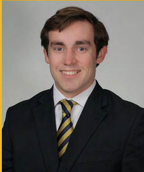
Undeclared - Whitman Kansas City, KS