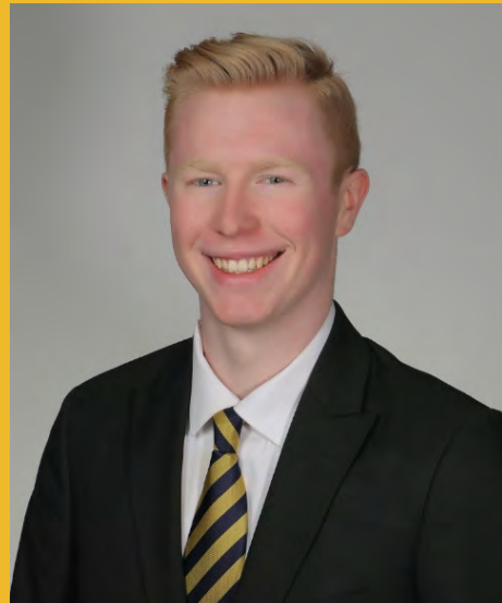
Mechanical Engineering Macungie, PA