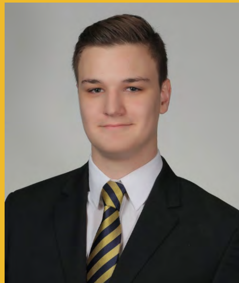
Acting Charlottesville, VA