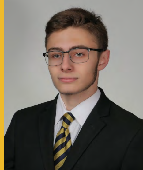
Information Management Briarcliff Manor, NY