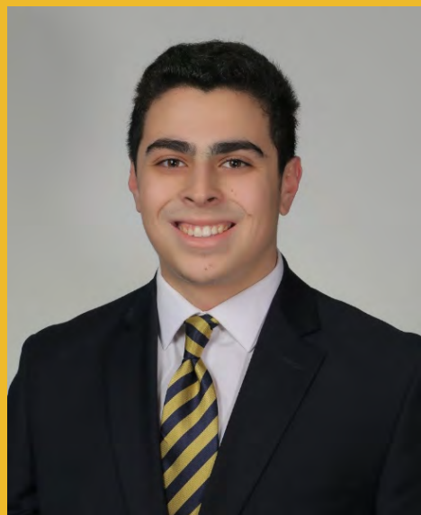
Television, Radio, Film/Finance Wilton, CT