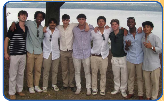
Brothers enjoying the gorgeous scenery at the DU winery event.