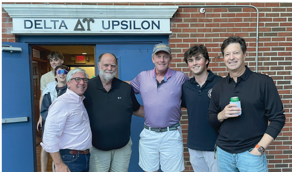
Brothers gather for the DU alumni reunion. A great time was had by all!