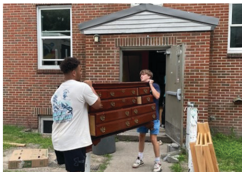
Brothers move into 721 Comstock.