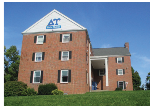
Our new home!

After a whirlwind year that saw our undergraduate brothers facing an earlier-than-expected end to our lease of 801 Walnut, heroic efforts to secure a much bigger house, and an intense clean-up and refurbishing, the brothers officially moved into 721 Comstock, owned by Sigma Phi Epsilon, right next door to 711. While we are once again in a short-term lease, there is a dedicated alumni team working to secure our 'Forever House' to ensure DU continues to be the leading fraternity on campus for the long term.