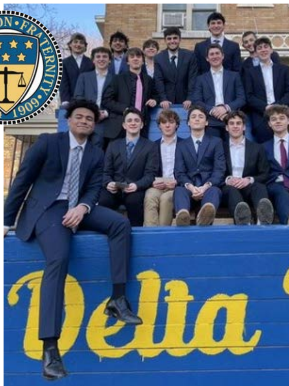
Syracuse Chapter Xi class on Initiation Day.

as a whole. She said we've proven we can build upon our 2022 DU Sweepstakes Award to make it a yearly award thanks to our structurally sound executive board.