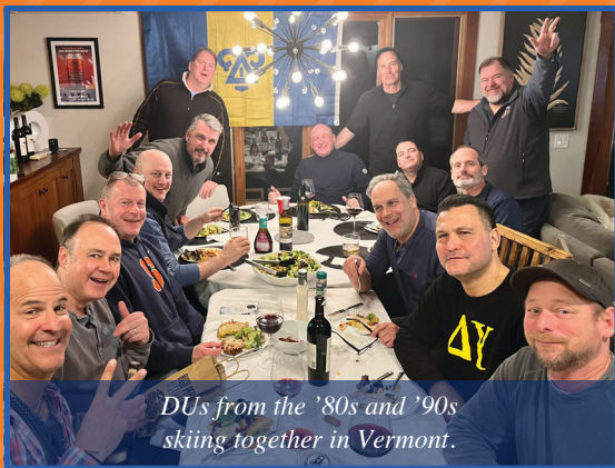
DUs from the '80s and '90s skiing together in Vermont.