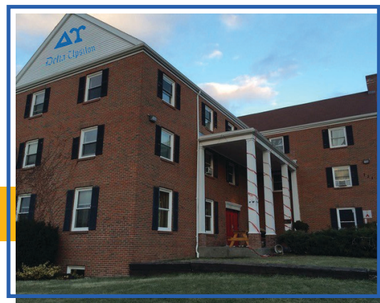
721 Comstock, our new house, for now.