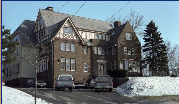
711 Comstock Ave.