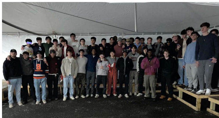
The chapter rehearses for V-DAY, the charity concert. Despite being in the middle of February, this event was run outside with a tent, including a full stage and production. This was one of our most successful philanthropy events, and we look forward to improving on it.

This semester has been a testament to the strength, resilience, and dedication of our fraternity. As we look back on our achievements, we recognize the collective effort that has propelled us forward. Delta Upsilon continues to thrive, and I am excited for what lies ahead as we build upon this momentum.