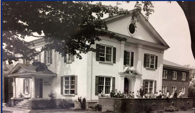
426 Ostrom Ave.

Delta Upsilon at Syracuse University • Spring 2025