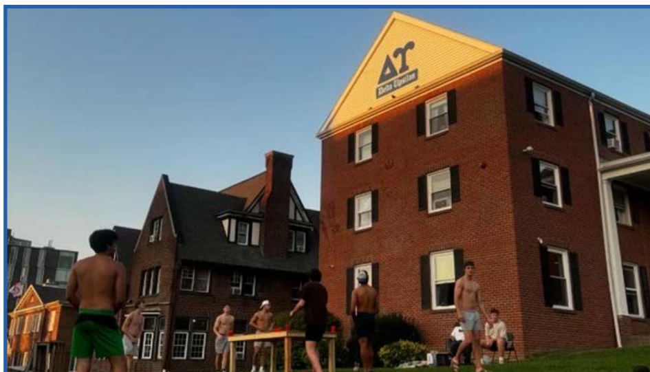
Brothers enjoy a beautiful autumn day outside of the chapter house, playing games and throwing the football around.