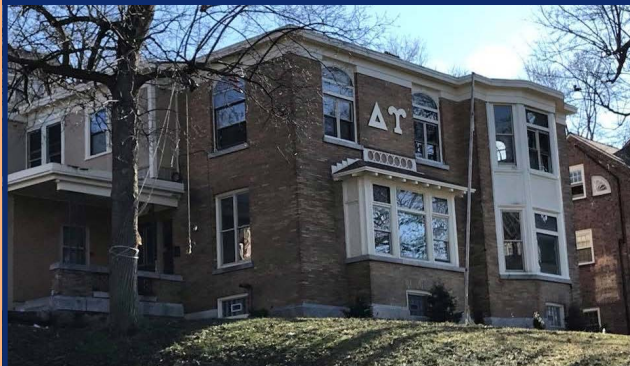
801 Walnut Ave.